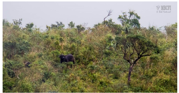
Tamaraw sighting in Mt. Gimparay