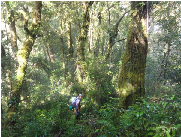
Upper montane/mossy forest Habitat (E. Schütz)