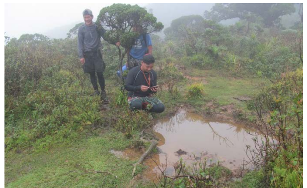
Wallow in upland dwarf vegetation habitat (DAF)