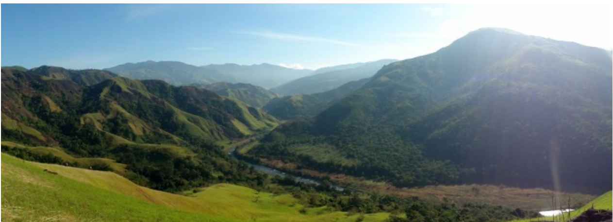
Along the Amnay River in Occidental Mindoro below forest tree line (E. Schütz)