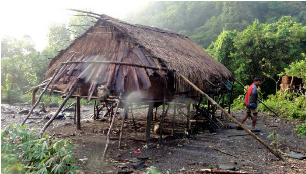
Alangan communal house, Si Liyao