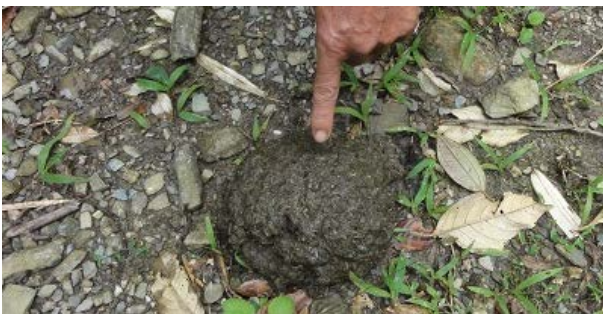
Tamaraw dung rich in fibers (E. Schütz)