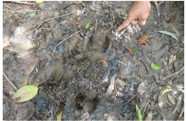
Tamaraw hoof mark in forest undergrowth (E. Schütz)