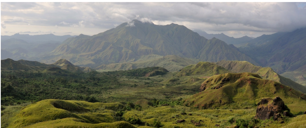
Bio-cultural Landscape of the Inner Mindoro Island, MIBNP (E. Schütz)

This will require strengthening coordination and collaboration with partners and expanding resources in order to achieve these broad goals. Additional sources of funding are therefore crucial.