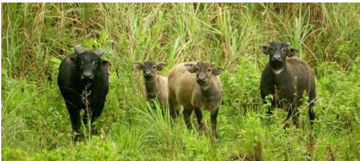
Family group of Tamaraw in Mts Iglit-Baco Natural Park

Furthermore, we are proud to welcome new international partners to support specific items of the program: Phoenix Zoo and Wildlife Reserve Singapore for the research work and community collaboration, National Geographic Society for the monitoring and protection effort with community collaboration, Prince Bernhard Nature Fund for the community based approach to build up a consistent framework of collaboration and mutual goals..