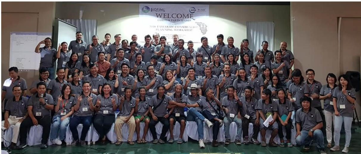
Closure picture of the PHVA Action Planning Workshop with all participants

Following months were kept busy with drafting and finalizing the Tamaraw Conservation and Management Action Plan document (TCMAP). The document lays out the future conservation strategy and efforts to be undertaken to ensure survival of the Tamaraw in the next 30 years.